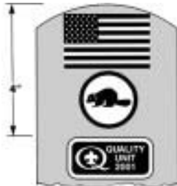
WEBELOS SCOUT RIGHT SLEEVE