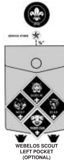
WEBELOS SCOUT LEFT POCKET (OPTIONAL)