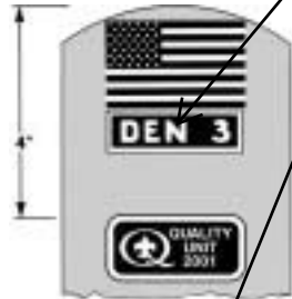
CUB SCOUT OR WEBELOS SCOUT RIGHT SLEEVE