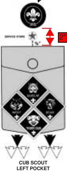
CUB SCOUT LEFT POCKET